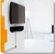
Hide the cables. SMS Cable Management.

Accessories: SMS Cable Management (Page 6:01).