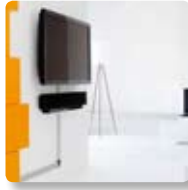
Hide the cables. SMS Cable Management.

SMS Flatscreen WM 3D Piano Black SMS Flatscreen WM 3D Glossy White SMS Flatscreen WM 3D Dark Grey